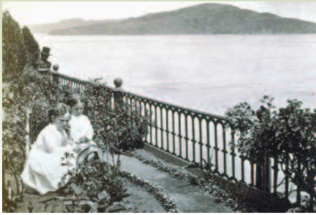
Citadel Garden 1869