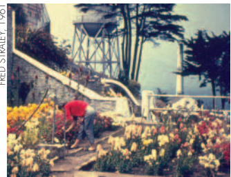
FRED STRALEY, 1961